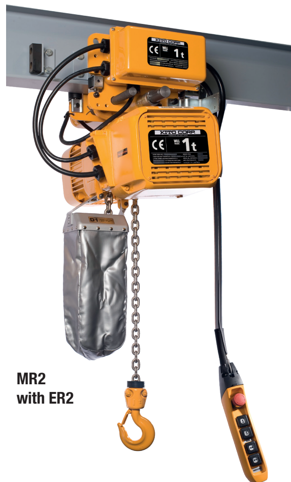
MR2 with ER2