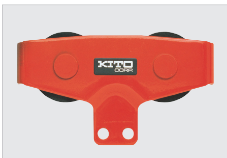
As option: TMH mini trolley